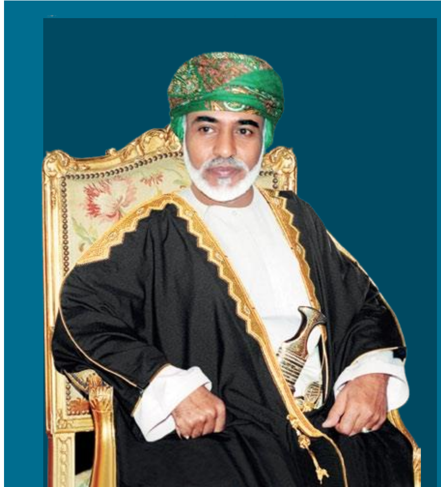
His Majesty Sultan Qaboos Bin Said