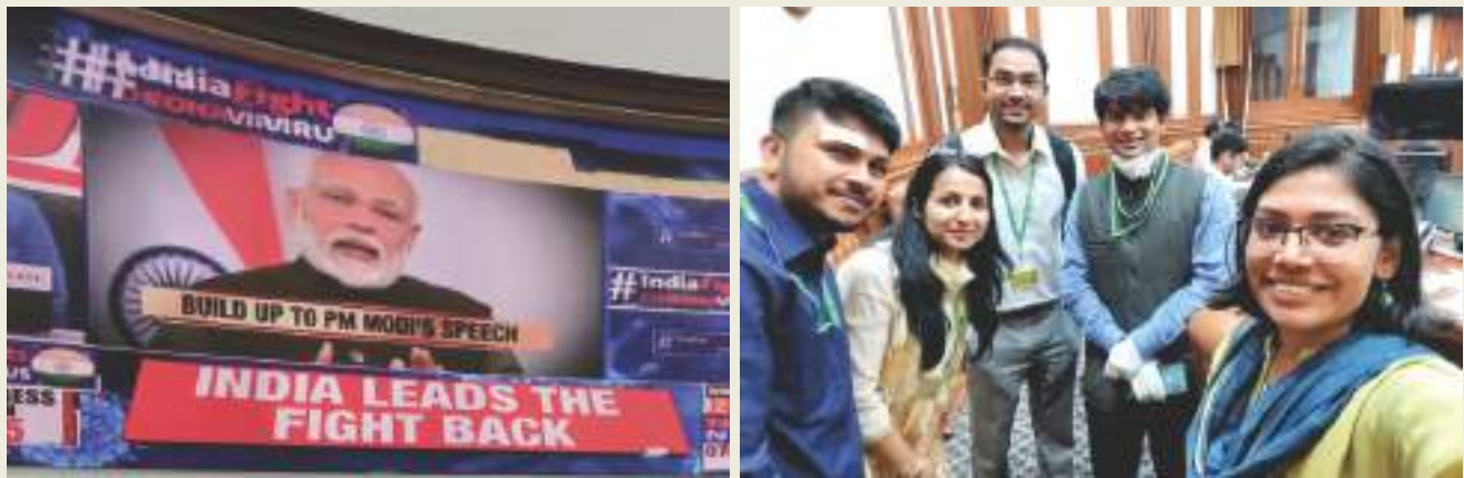
(Deployment of IFS OTs at COVID-19 Control Room, MEA, New Delhi)

Phase-II of ITP commenced on 15 June 2020 through webinar and is in progress.