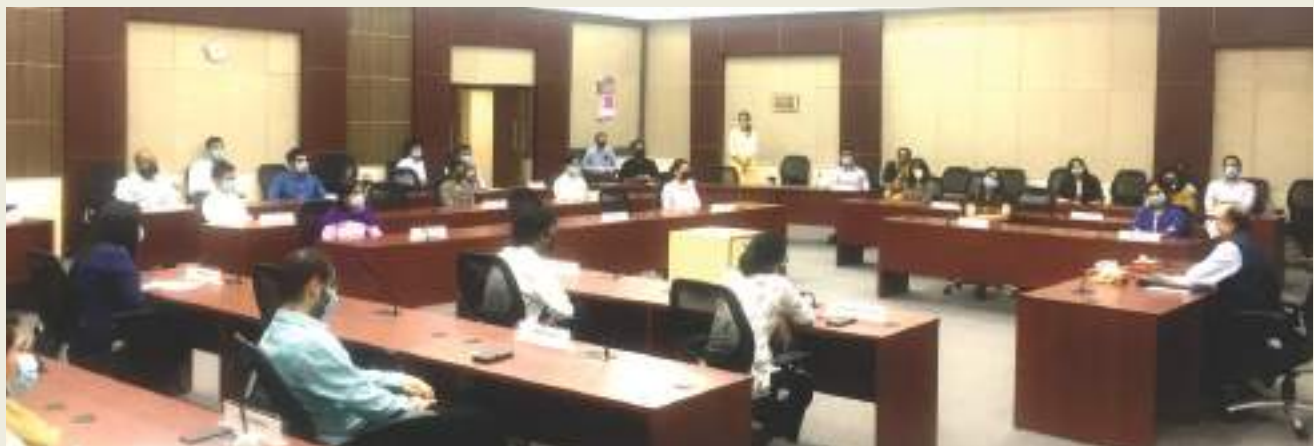
(Address by Dean (SSIFS) to IFS OTs in the Phase-II of ITP)