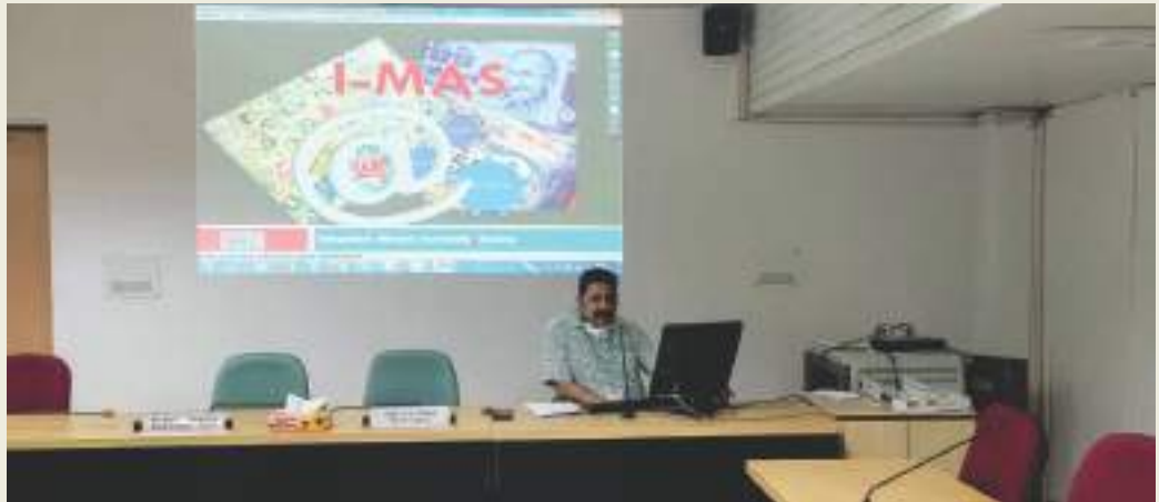
(Speaker addressing on webinar to participants of IMAS Training Programme)

A 1-day IVFRT (consular) training was conducted on 13 June through webinar. The training was attended by 51 participants.